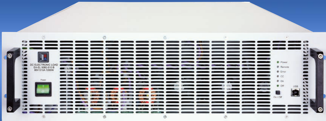
EA-EL 9080-510 B Slave