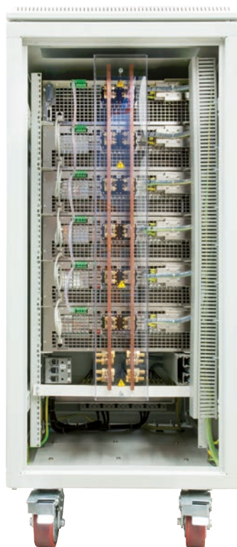
Rear view 24U 90 kW