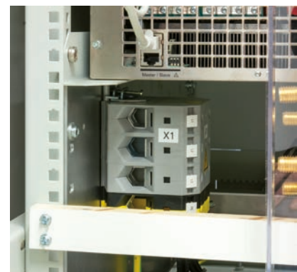
AC input terminal