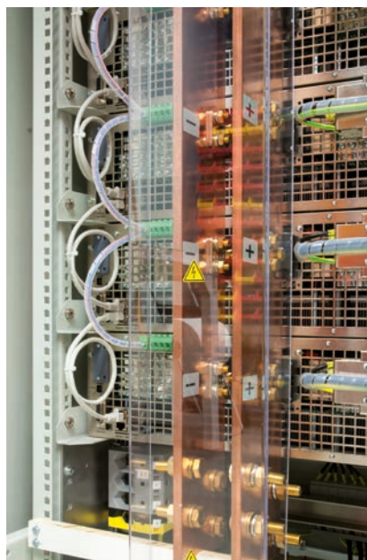
DC bus terminal